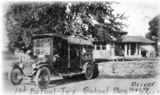
The first Bethel Township school bus