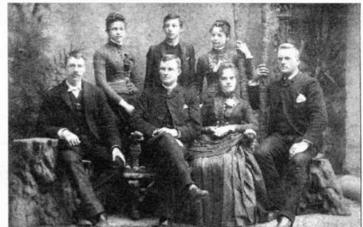
The first Olive Branch School graduating class.